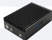
Available 220V System Benchtop Amplifier