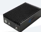
Available 220V System Benchtop Amplifier