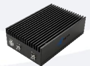
Available 220V System Benchtop Amplifier