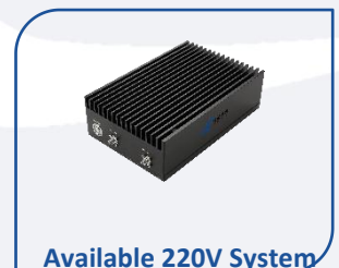
Available 220V System Benchtop Amplifier