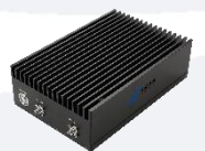
Available 220V System Benchtop Amplifier